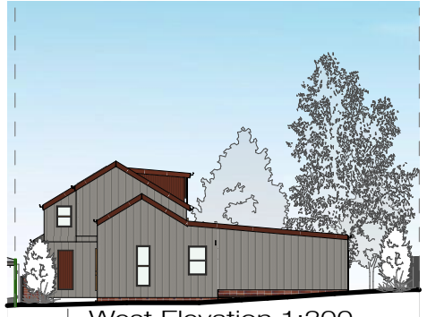
E-05 West Elevation 1:200